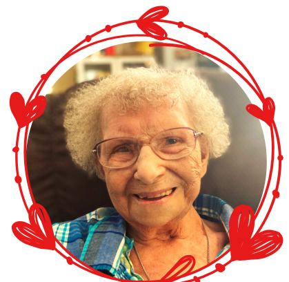
Food ~ LaRue