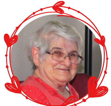
Jesus ~ Pat