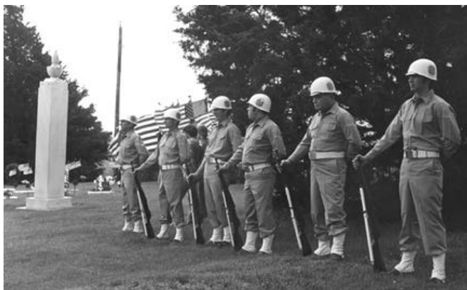
Memorial Day, Concordia, 1973

In 1971, the 26th amendment gave 18-year-olds what right?